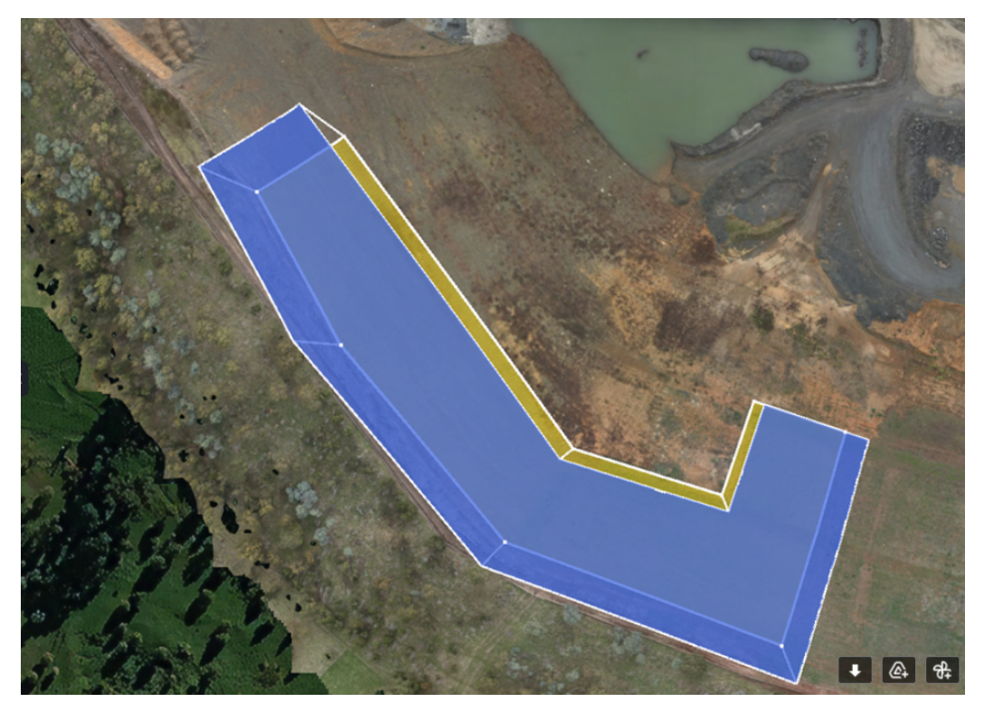
Figure 5 - Identification of the 1.25 Hectare Revegetation Site