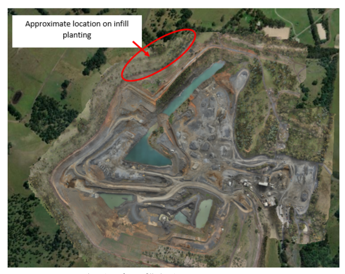
Figure 3 - Approximate location of Q3 infill planting