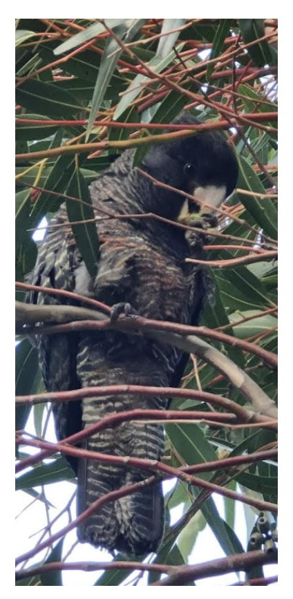
Figure 2 - Photo of Gang-gang cockatoo (Callocephalon fimbriatum) on some Eucalyptus

At least two female Gang-gang cockatoos ( Callocephalon fimbriatum ), an endangered species, were observed on some Eucalyptus on the SE corner of SE Extraction.